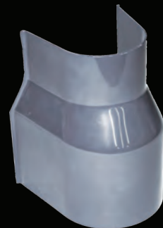
Non-Flanged Reducer Boot