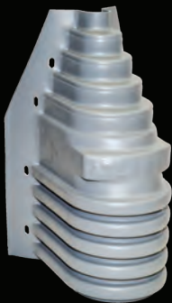
Universal Reducer Boot